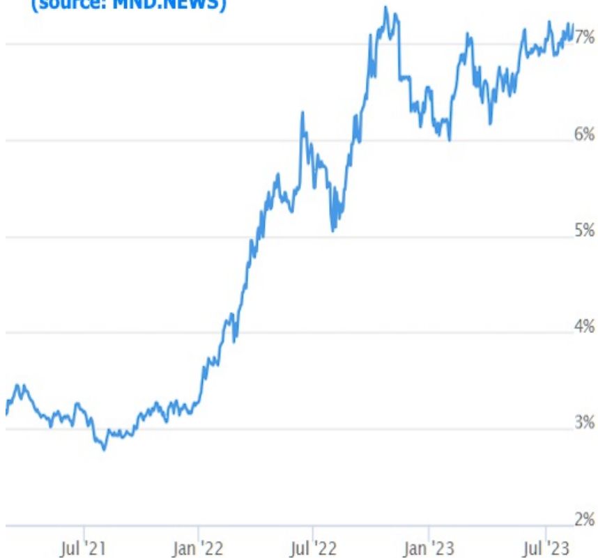
30yr fixed mortgage rate index

This is the new and persistent reality until one of 3 things happens: