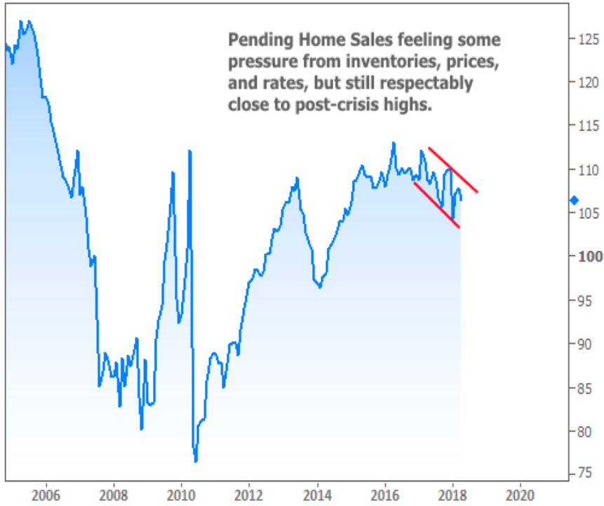
Pending Home Sales