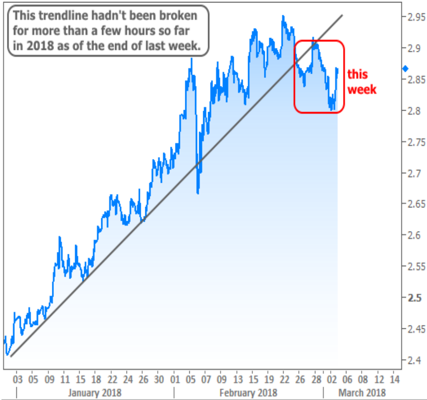
US 10yr Yield ("rates")