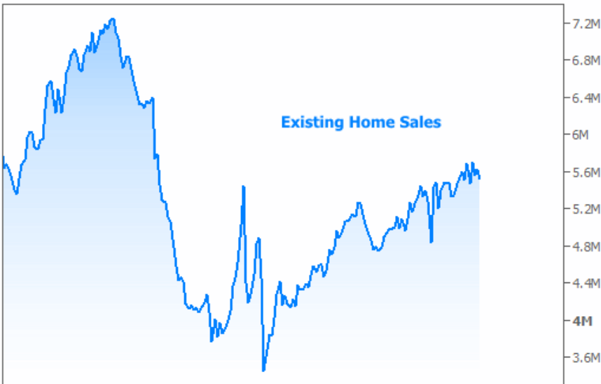
Existing Home Sales