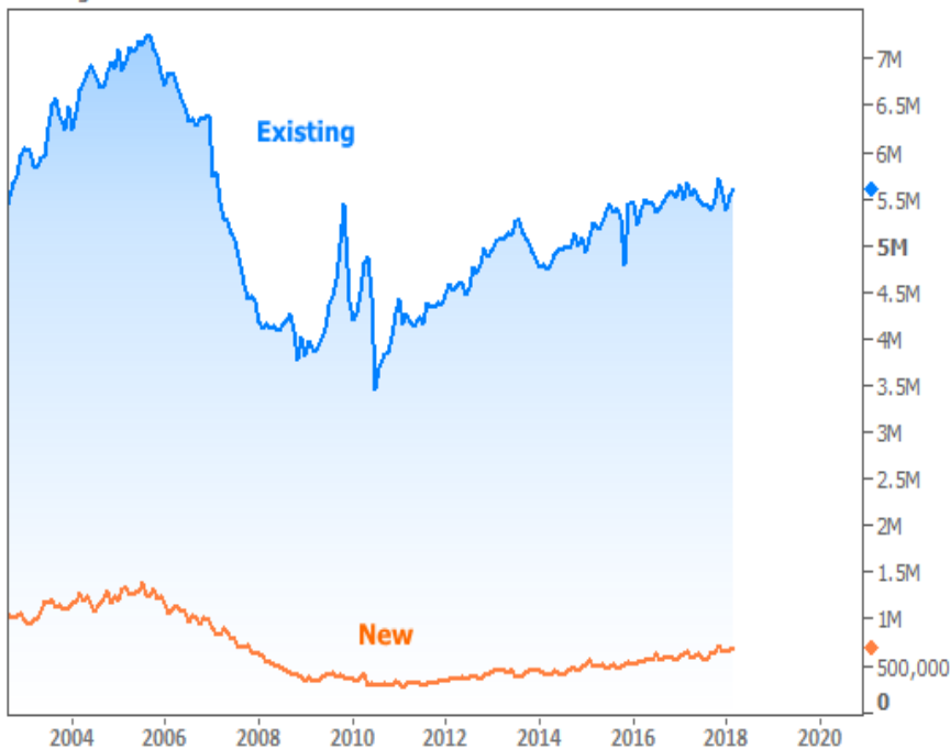
Existing vs New Home Sales

Next week brings the big jobs report (Employment Situation/Nonfarm Payrolls), which always has the potential to cause volatility for rates. Before that, we'll get a Fed policy announcement on Wednesday. The Fed can also cause huge moves for rates, but it's somewhat less likely next week. The Fed has 2 types of meetings: those that result in an announcement AND updated forecasts (as well as a press conference with the Fed Chair) and those that simply end with the announcement. Next week's is the latter, and that iteration tends not to pack the same sort of punch.