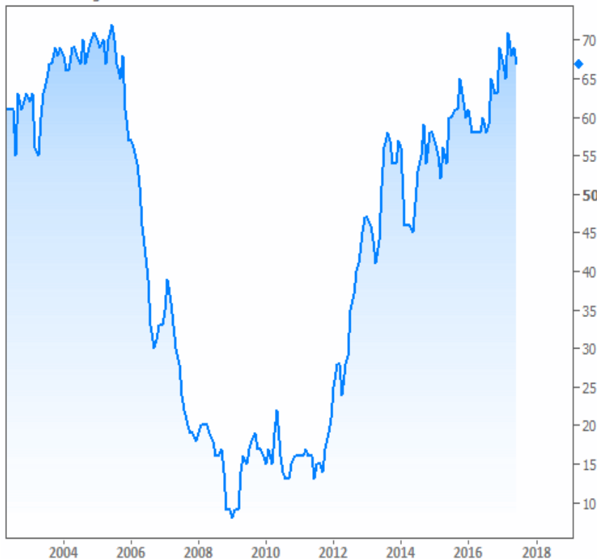
NAHB Housing Market Index

It's harder to offer a compelling counterpoint for Friday's New Residential Construction data from the Census Bureau. Both Housing Starts and Builder Permits came in well below forecasts, prompting National Association of Realtors' Chief Economist to say "housing shortages look to intensify and may well turn into a housing emergency if the discrepancy between housing demand and housing supply widens further."