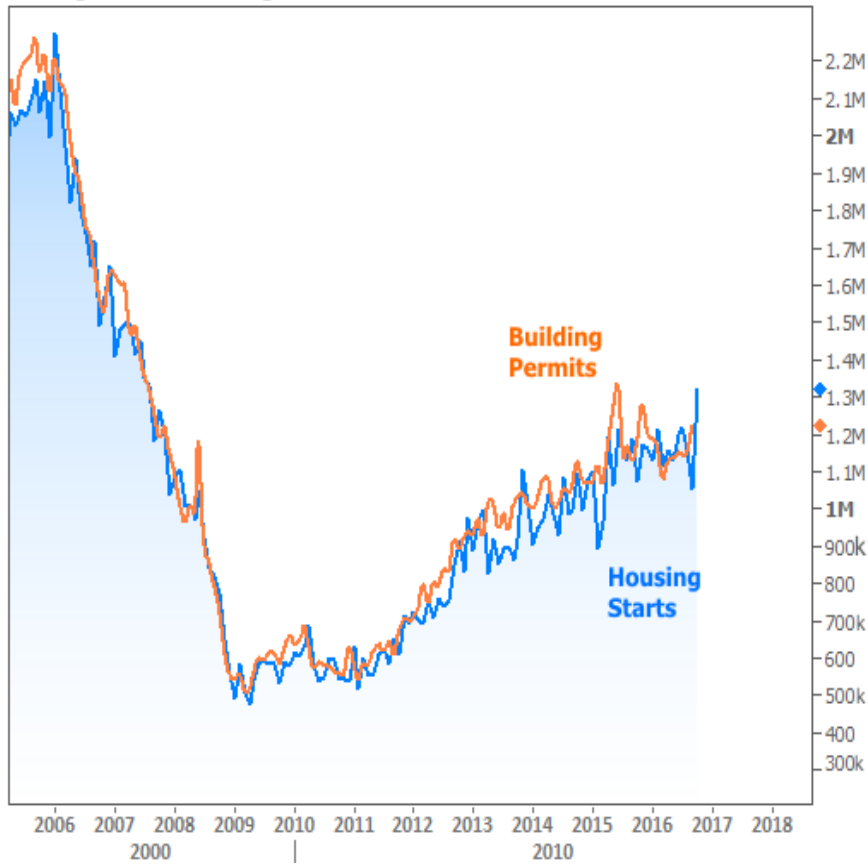
Housing Starts and Building Permits

Subscribe to my newsletter online at: http://mortgageratesweekly.com/scottkepler