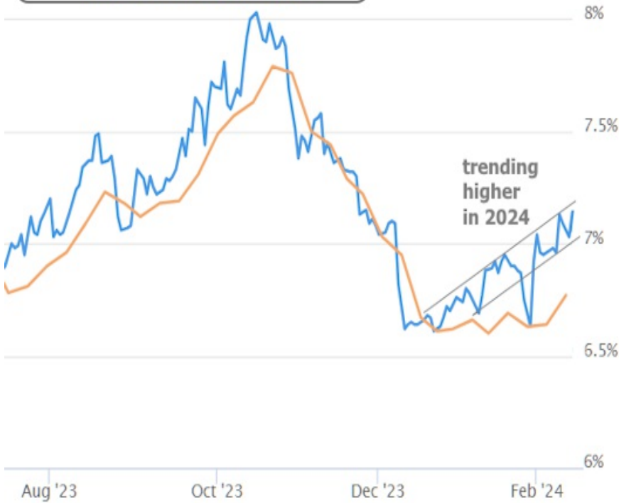
--Freddie Mac Weekly Survey --MND actual daily average