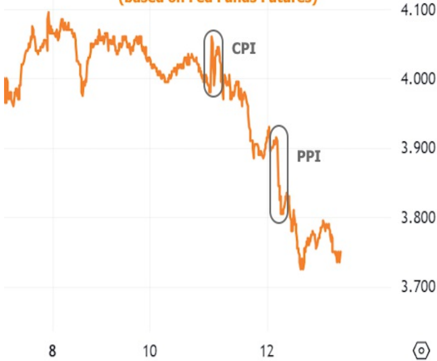
Fed Funds Rate Expectations, end of 2024 (based on Fed Funds Futures)

Mortgage rates don't correlate perfectly with Fed Funds Rate expectations (one reason we often advise that a Fed rate cut/hike doesn't mean a mortgage rate cut/hike). As such, they're not back below the recent lows, but they definitely haven't moved much higher. This week's gentle descent means we're continuing to hold a vast majority of the improvement seen in Nov/Dec.