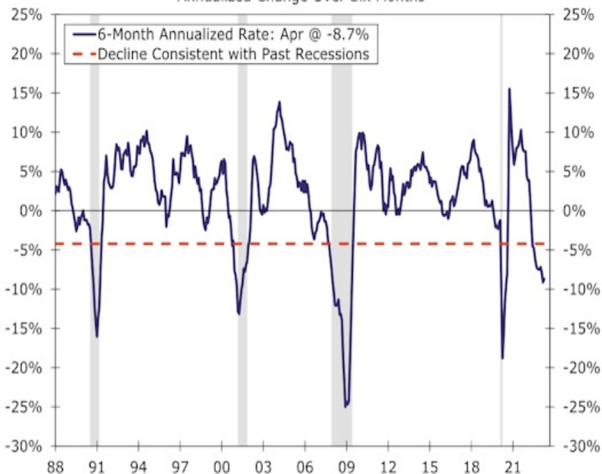
Leading Economic Index Annualized Change Over Six Months

It's quite easy to ping pong the debate back and forth between "recession" and "it's not so bad" with other data out this week. While we're on the topic of sentiment surveys how about Consumer Sentiment itself? It may be historically low, but it has also been trending fairly consistently higher (in stark opposition of the trend seen in the chart above).