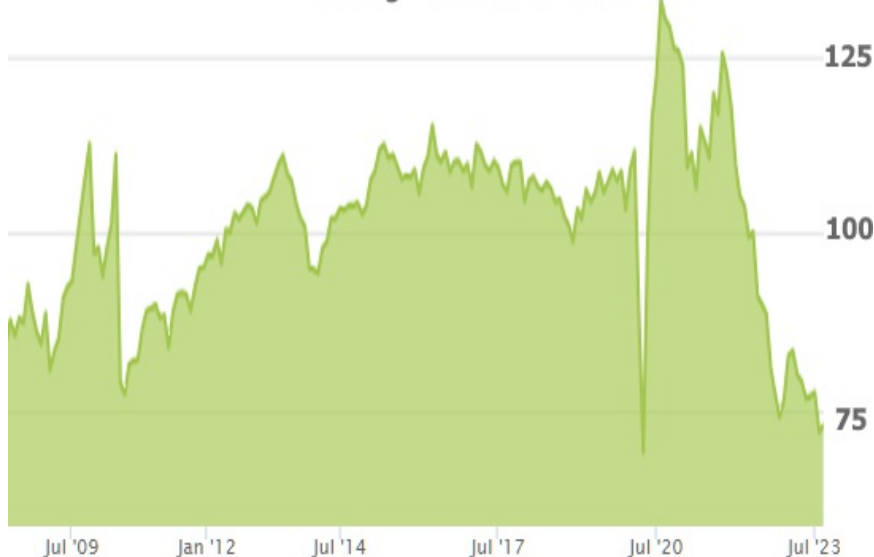
Pending Home Sales Index

Both charts convey post-covid volatility, but one says the housing market is stable and improving while the other says it's as bad as it's been in decades. How can two reports on home sales tell such different stories?