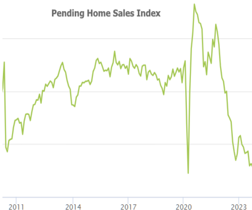
Pending Home Sales Index

It's a similar story for interest rates. 2022 was marked by the largest change in mortgage rates in a single year since 1981, but 2023 took the outright levels just a bit higher.