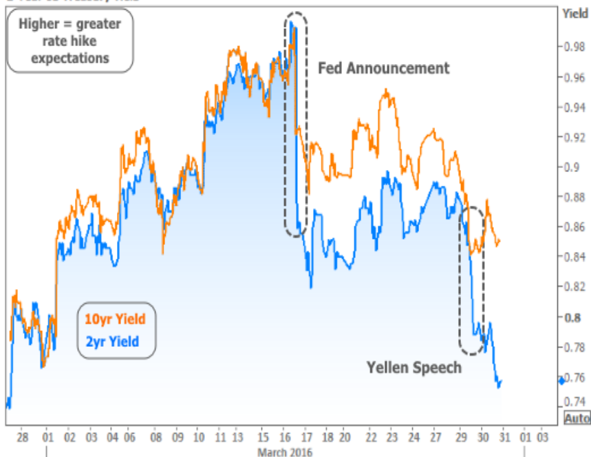
2-Year US Treasury Yield

We can come to terms with the paradox by remembering that there are different kinds of rates. The biggest difference between otherwise similar rates is their duration (i.e. 10yr Treasury notes vs 2yr Treasury notes). Investors’ appetites for various durations are greatly informed by Fed policy. It’s the shorter durations that are most receptive to the Fed’s rate stance, as we can see in the following chart (we’re using 10yr Treasuries as a proxy for minute-to-minute mortgage rate momentum because mortgage rates usually only change once or twice per day. Thus 10yr Treasuries show more variation, while remaining almost perfectly analogous to 30yr fixed mortgage rates over time).